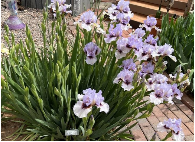
Figure 12 Franklin Cook Memorial Cup (most popular out of region iris) – "Perry Dyer" – AB (OGB-) 2017 Paul Black