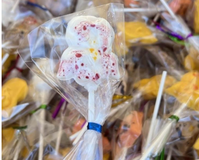
Figure 4 Albuquerque and Aril Iris Society served as hosts for Blue J Irises and created homemade Iris suckers