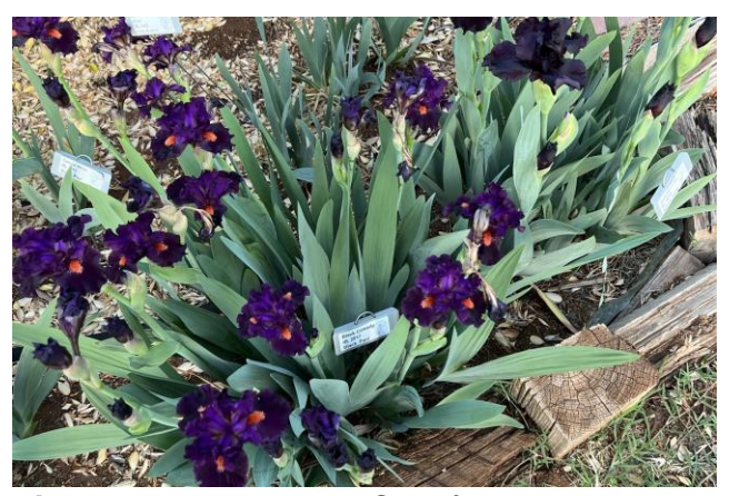
Figure 13 Ben Hager Cup (most popular median iris) – "Black Comedy" – IB 2017 Paul Black