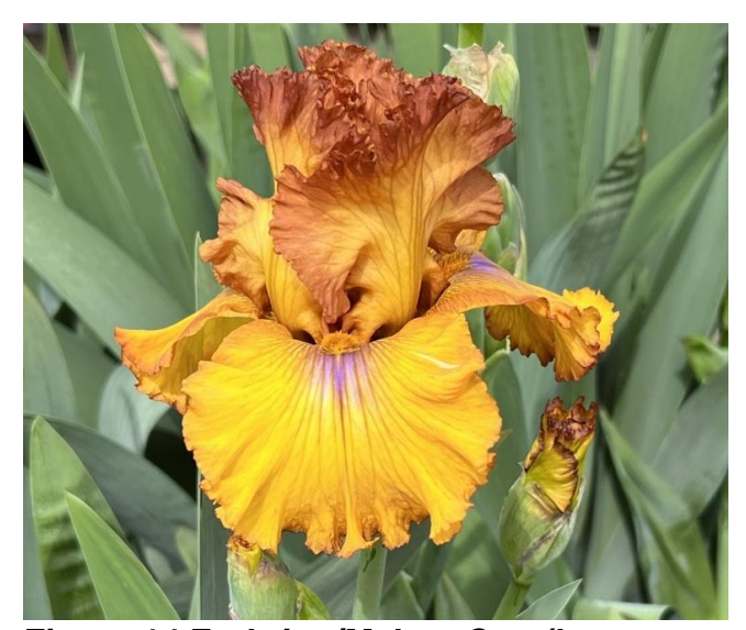
Figure 14 Zurbrigg/Mahan Cup (best seedling) – "SK-17" TB – Steve Kelly