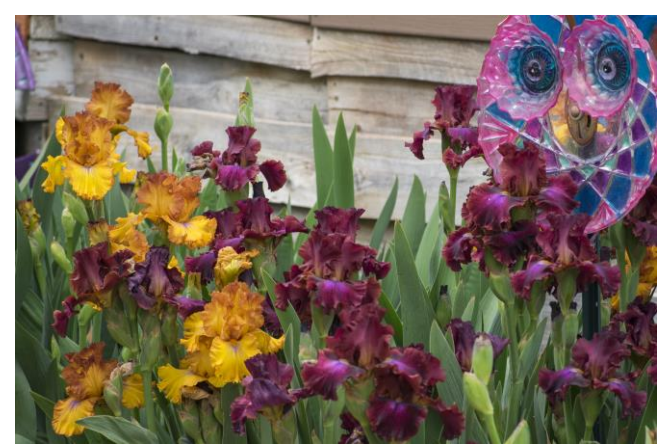
Figure 11 SK17-1 and Martian Sunset in the Ayres Garden