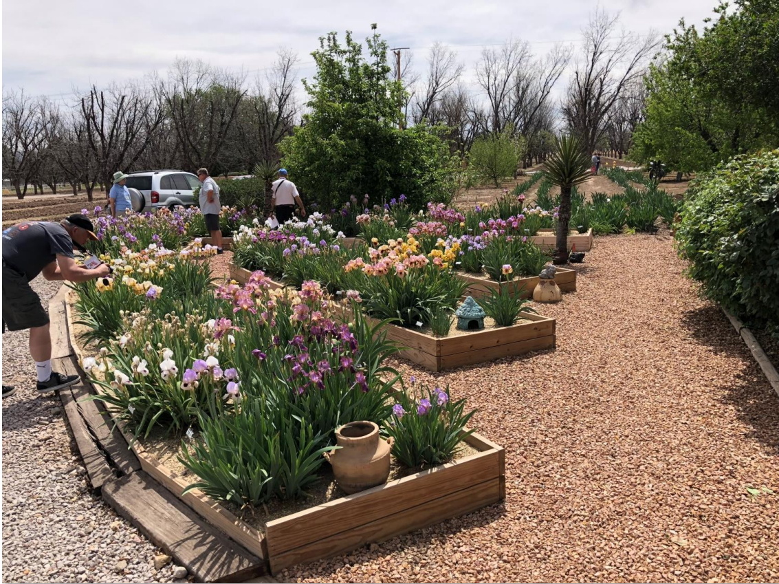
Figure 2 2018 ArilTrek at the Wilsons