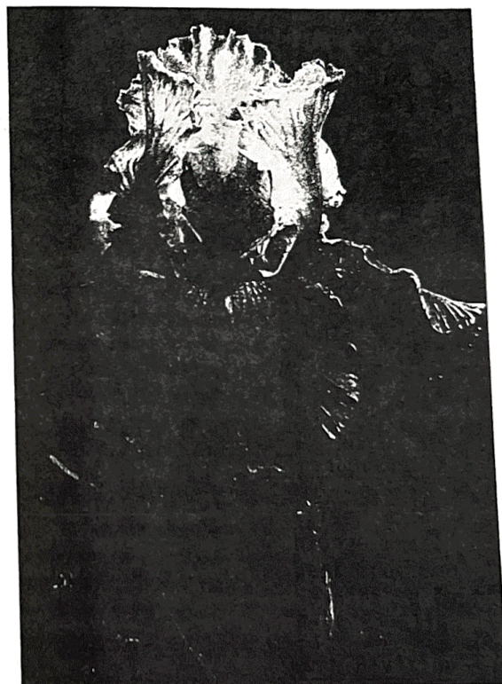
SPICED CUSTARD (Weiler 87) $30.00